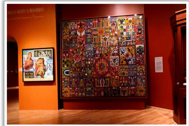
Nuestras Historias Exhibit

Located in the heart of Chicago, The National Museum of Mexican Art opened its doors in 1987 with a mission committed to accessibility, education and social justice. The Museum features 3,000 years of Mexican culture throughout their 9,000 seminal pieces. Attendees will receive a guided tour experiencing landmark exhibitions. The tour will kick off with a special guest speaker who will discuss refugee/immigration rights and ways in which we can assist these communities.